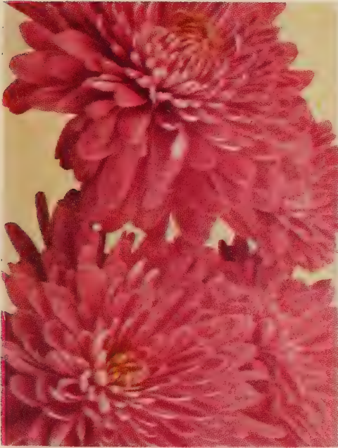
© SEPTEMBER DAWN. 50c each; 3 for $1.25